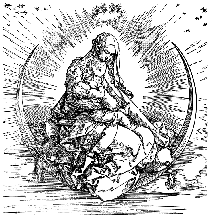
Albrecht Dürer, The Madonna on the Crescent , Frontispiece to The Life of the Virgin , c. 1511. Woodcut. The Metropolitan Museum of Art. Public domain (CCO).